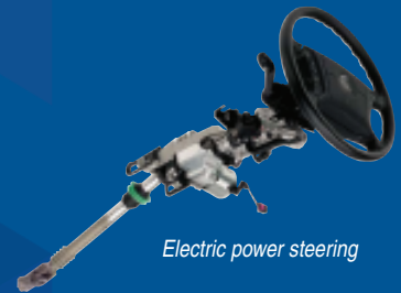
Electric power steering