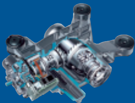
Torque case transfer